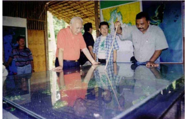
Briefing of the benefit of the communication network