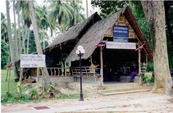
The site of the Community Communication Centre