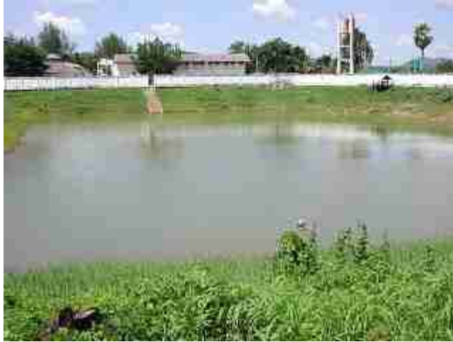
A pool of rain water which has turned into sea-water