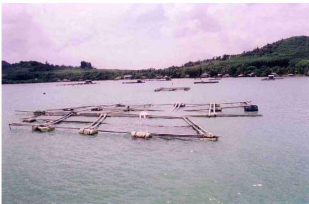
The damaged Floating Bamboo Cages