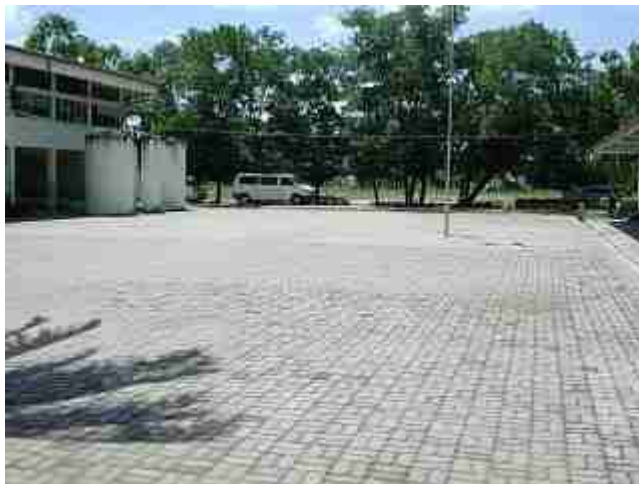
The site of the school where two rain water tanks (150 cubic metres) will be constructed