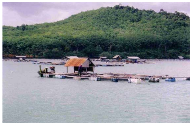
Undamaged Floating Bamboo Cages